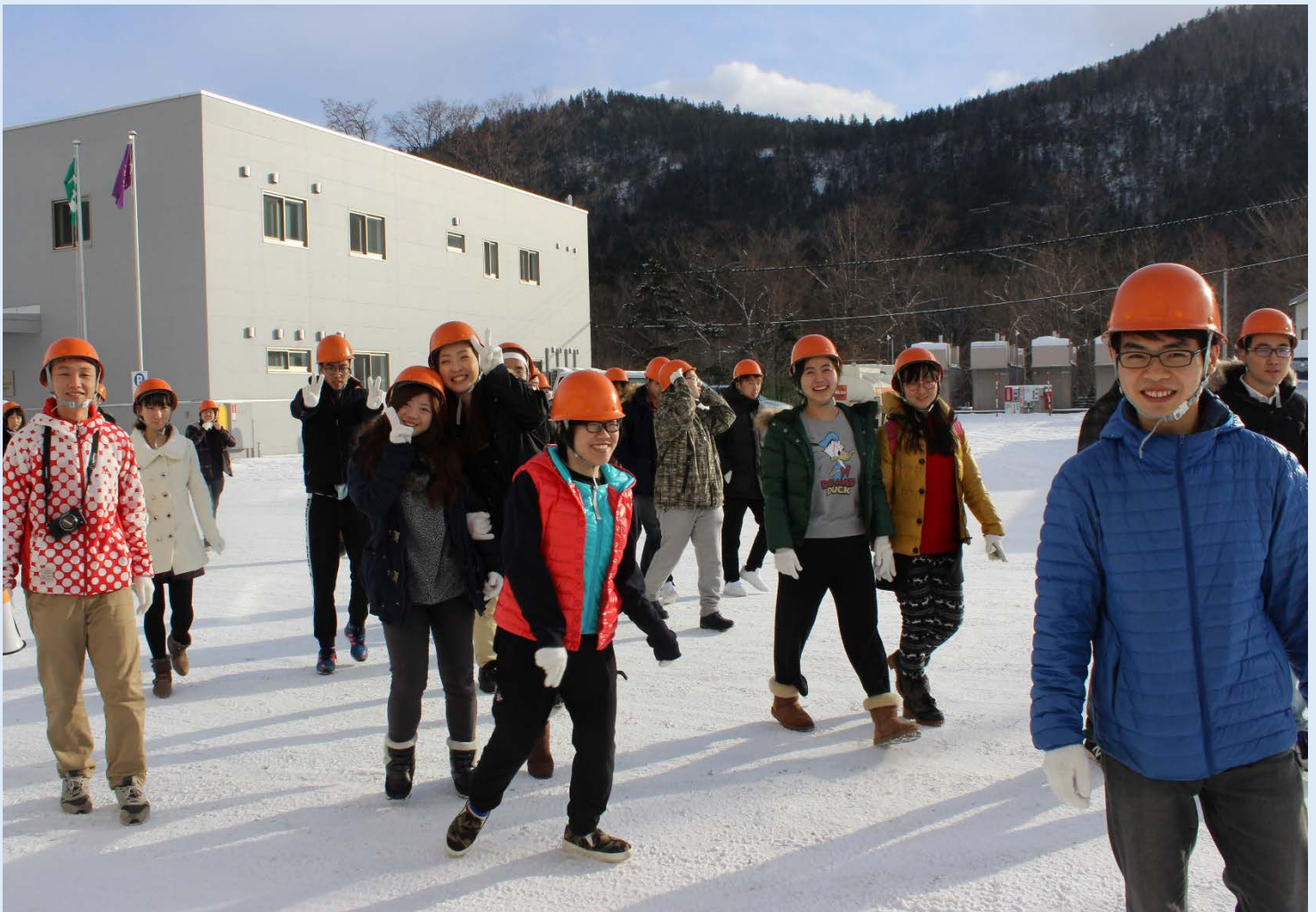
Factory Tour: Itomuka Plant