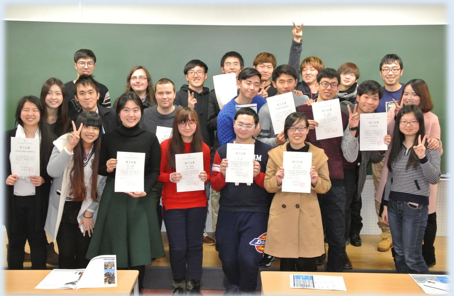
Short-term Foreign Students Graduation Ceremony