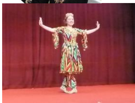
Performance by KIT foreign students