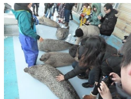
Okhotsk Seals Rescue Center

Through this event, the foreign students could understand not only “Northern Regions” culture, but also “Japanese Hospitality”. They also enjoyed meeting and communicating with residents in Monbetsu. We thank Monbetsu city for inviting us and treating us with wonderful hospitality.