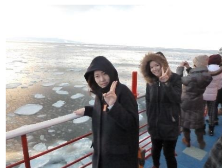
GARINKO-GO II: Ice-breaker

International students and staff were invited to “the 31 st Northern Regions Symposium” in Monbetsu. We went there together by bus from Kitami. After the symposium, there was a party and some foreign students performed to introduce their culture. Each foreign student stayed overnight with a family in Monbetsu. They had a very good experience during that homestay. The next day, they went aboard an ice-breaker called “GARINKO-GO II” from Monbetsu seaport and saw sea-ice. They also went to “Okhotsk Seals Rescue Center” and touched seals, visited the Okhotsk Sea-Ice and Science Center called “GIZA”.