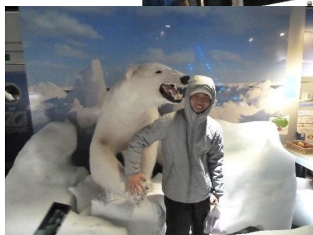
Okhotsuk Sea-ice and Science center “GIZA”