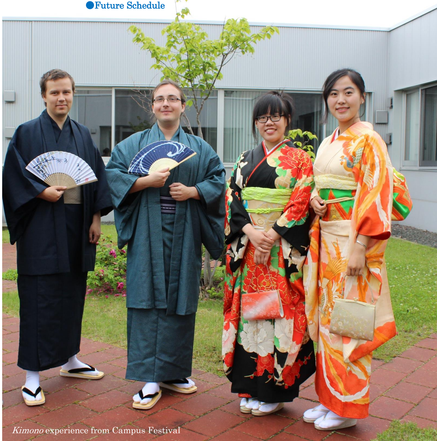
Kimono experience from Campus Festival