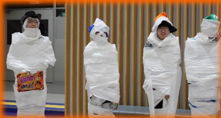
New International Students became Mummies!!!